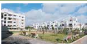
Green Acres - Perungudi Duplex Row houses and 2 & 3 BHK apartments in 10 acres