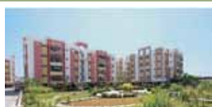
Serene Acres Thoraipakkam 2& 3 BHK apartments in 4 acres