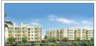
Verdant Acres Perumbakkam 2 & 3 BHK apartments in 2.43 acres