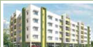
Tranquil Acres Phase I Kovilambakkam 2 & 3 BHK apartments in 5 acres